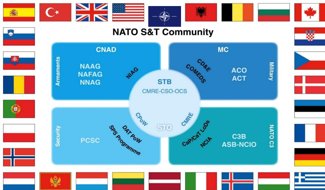
Figure 1: NATO S&T Community

19. Unified governance of NATO S&T is exercised through the NATO Science and Technology Board (STB) , composed of national representatives and NATO S&T stakeholders. The NATO Chief Scientist chairs the STB with the support of two Co-Vice-Chairs from NATO’s International Staff and International Military Staff. The STB promotes coherence of NATO S&T through objectives set out in the NATO S&T Strategy, focuses work through medium-term NATO S&T Priorities (see Table 3) and serves as a focal point for all NATO S&T programs of work.